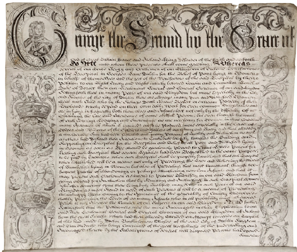
Royal Charter - Figure 1 Pertaining to Sections I and II