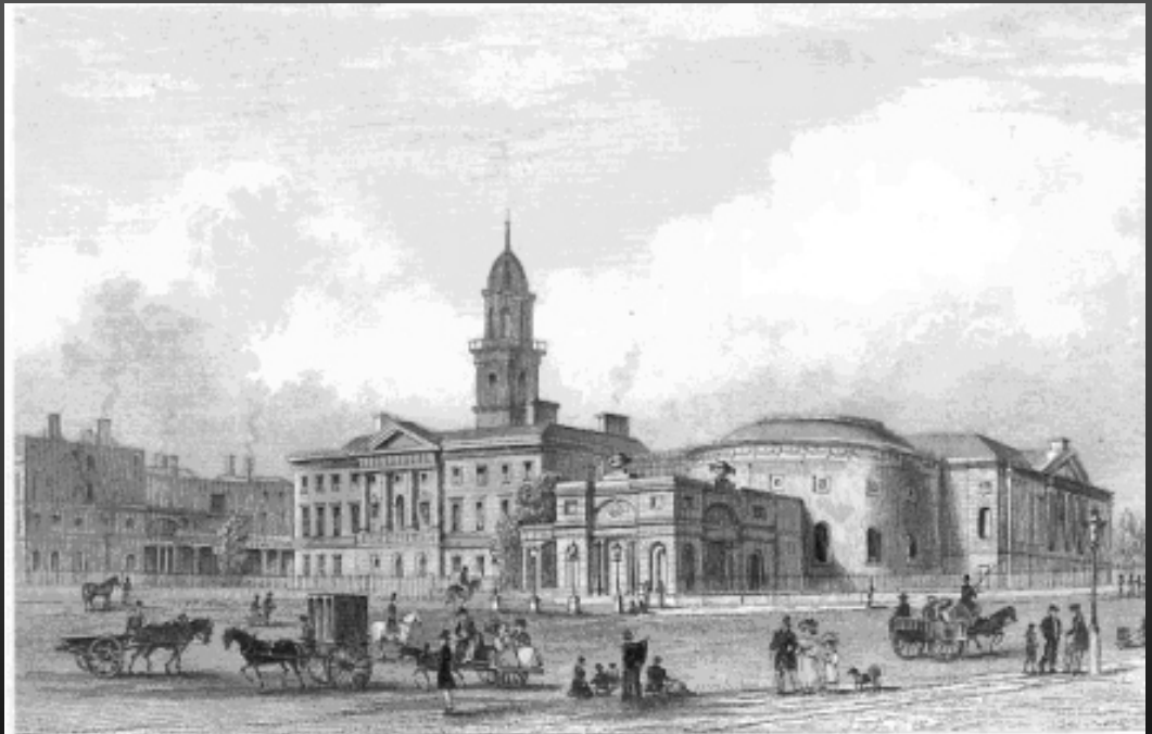
Rotunda Hospital circa 1830